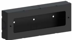
Surface mounting box for easy cabling (VEKTER 2) LIGA-SCE-VEKTER-2