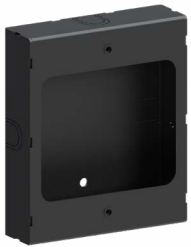
Surface mounting box for easy cabling (TANGO 31) LIGA-SCE-TANGO-31