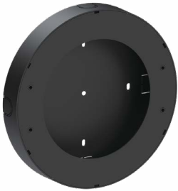
Surface mounting box for easy cabling (ABACUS 3) LIGA-SCE-ABACUS-3