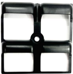
Integrated Glare Technology LIGA-IGT